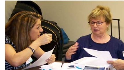
Role play is a large part of the training.