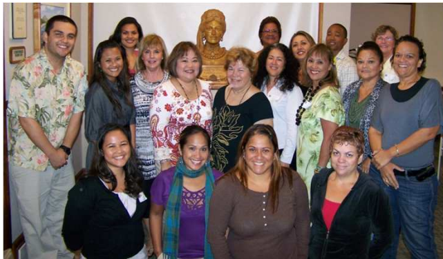
Trainees come from both community and clinical settings.