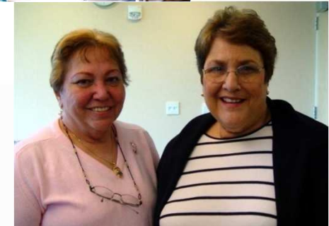
Cancer Survivors are part of the faculty.