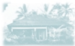
Halehuki circa 1940

American Cancer Society 1-800-227-2345 www.cancer.org